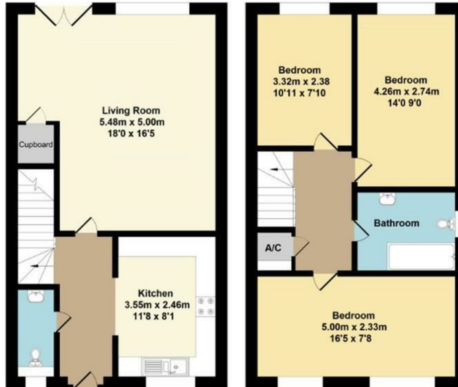
Ground Floor Approx. Floor Area 46.00 Sq.M. (496 Sq.Ft.)

Whilst every attempt has been made to ensure the accuracy of the floor plan contained here, measurements of doors, windows, rooms and any other items are approximate and no responsibility is taken for any error, omission, or mis-statement. This plan is for illustrative purposes only and should be used as such by any prospective purchaser. The services systems and appliance shown have not been tested and no guarantee as to their operability or efficiency can be given.